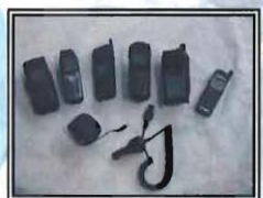
CELL PHONES AND CHARGERS