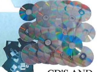
CD'S AND FLOPPIES